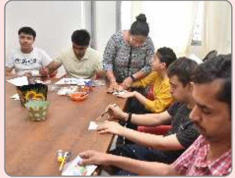
Art & Craft

Stationary items, paper bags, table mats, coasters, photo frames, gift items, napkin holders, baskets, painting, jewellery making, art & craft products etc.