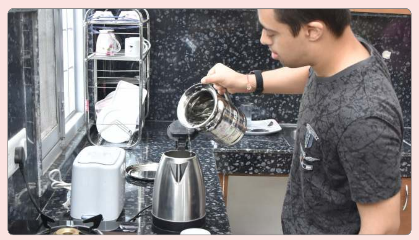
Basic cooking for oneself

B) Daily household chores like laundry, cleaning, ironing, making a bed, folding clothes, table setting etc.