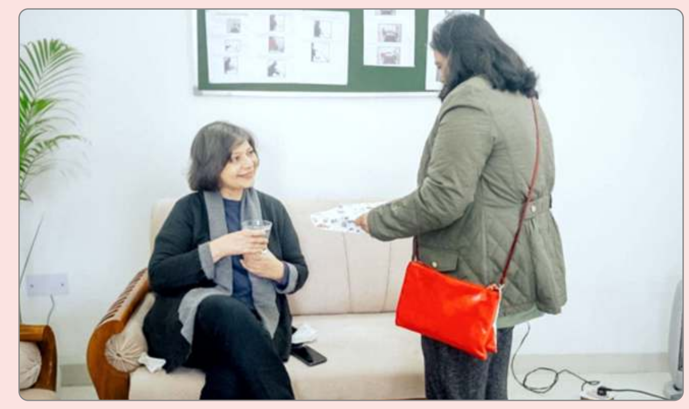
Social etiquettes & Communication