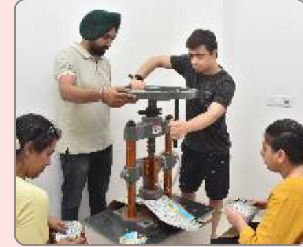
Paper Plates (Dona) Making

B) Culinary Arts: Cooking / Baking cakes and cookies, Making pickles and squashes, salads, sandwiches etc. Masala grinding & packing.